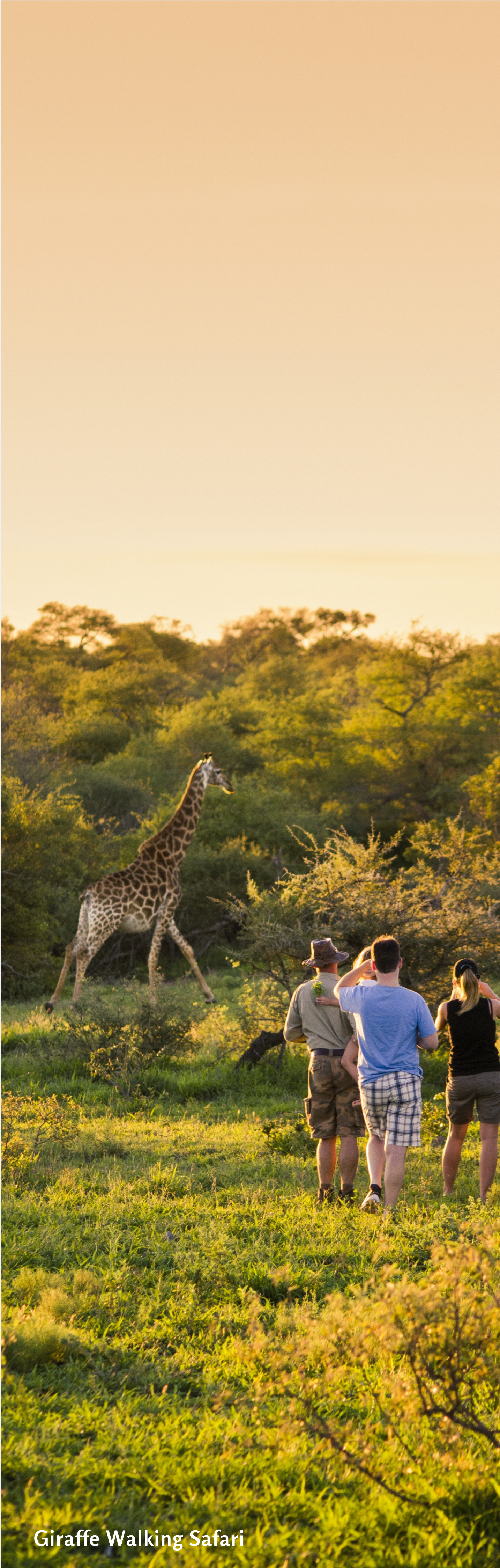
Giraffe Walking Safari

DAY 7 - DEPARTURE - After breakfast, leisure time for check out, prior to your transfer to Cape Town International Airport to board your onward flight home. SERVICES END