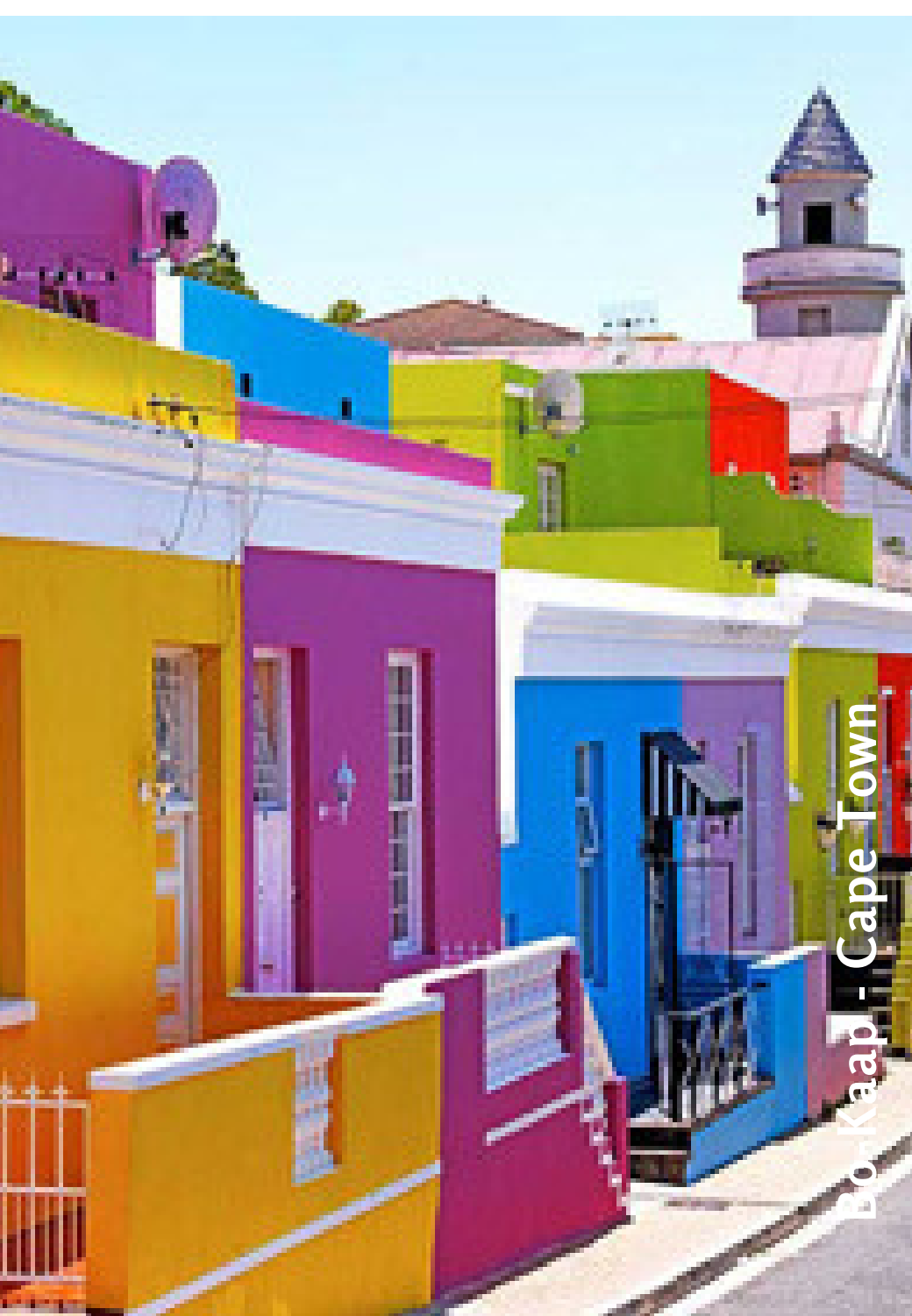
Bo-Kaap - Cape Town