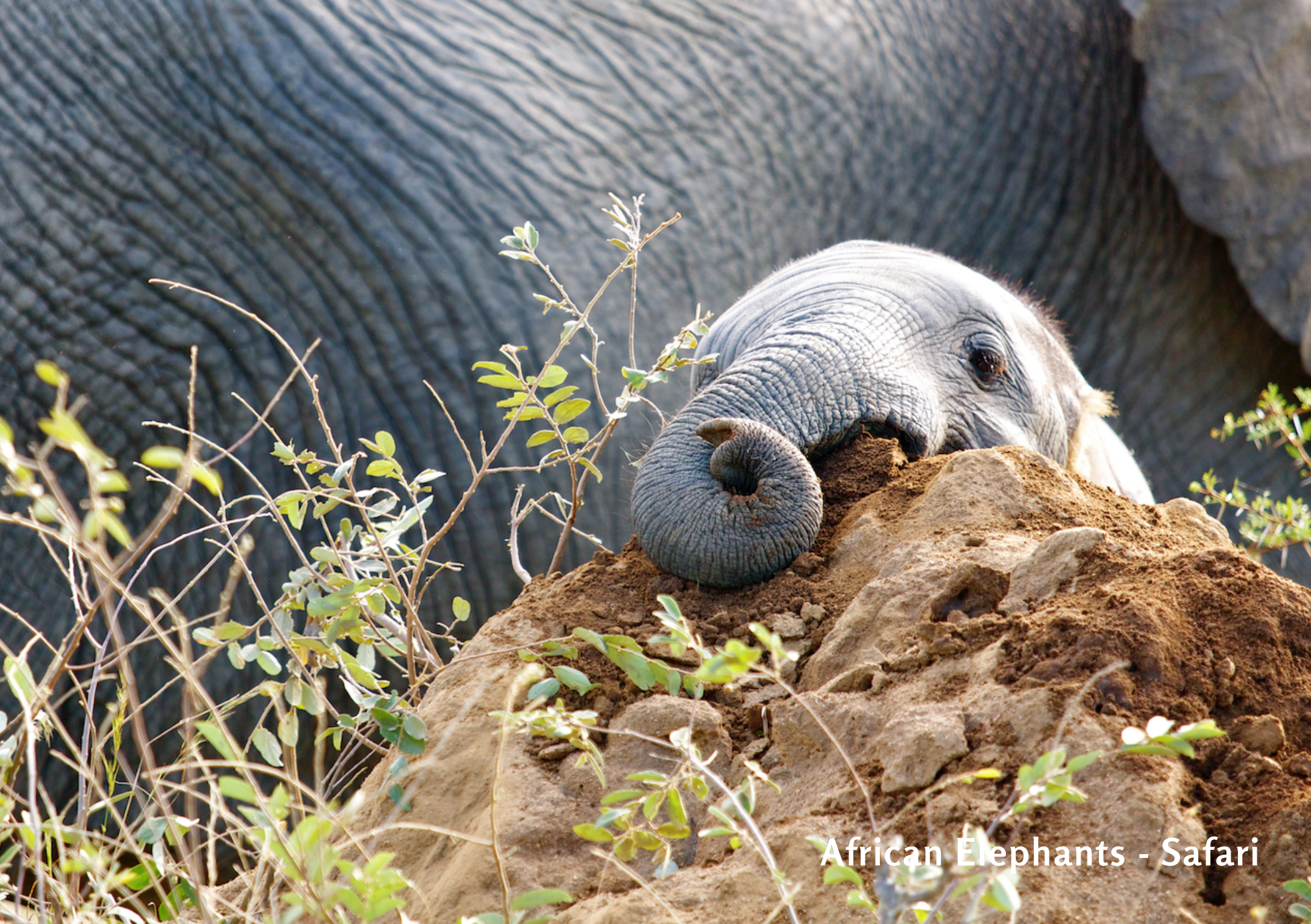
African Elephants - Safari