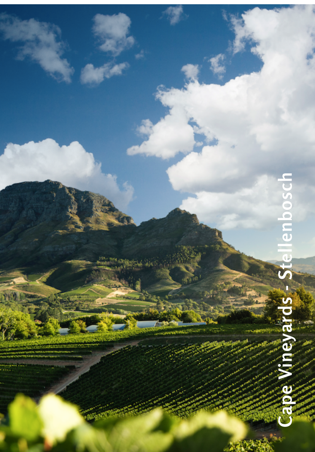
Cape Vineyards - Stellenbosch